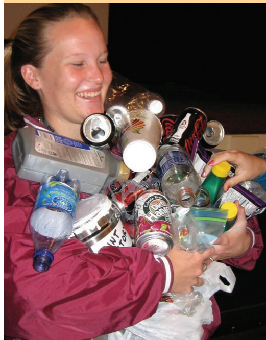
"Human River" of Pollution