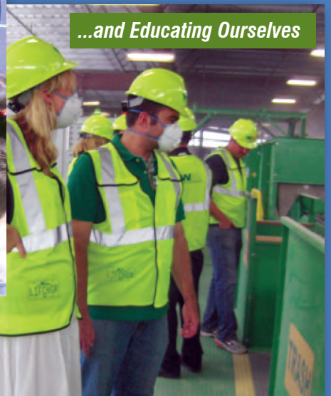
...and Educating Ourselves